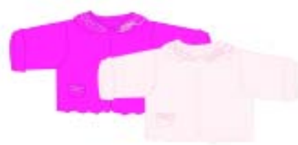
Style E80959 Softie Jacket Snugly Soft! Sweet jacket with collar and velvet embroidered trim all out of our new softy pile. Available in newborn to 4T.