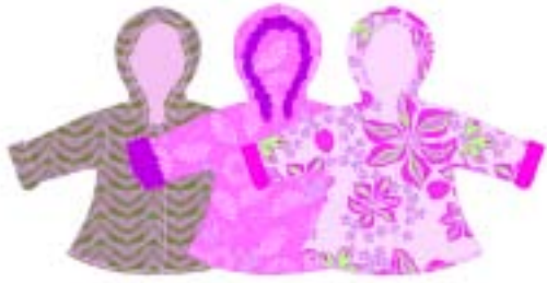
Style E8G945 Hooded Swing Coat Our new A-line swing jacket is just too cute to pass up! Available in newborn to 4T.