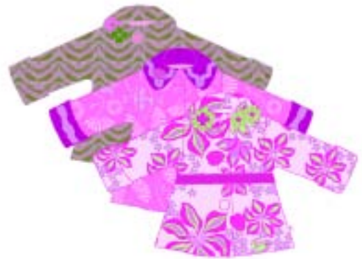
Style E8G145 Sweet Pea Coat Button front A-line coat and fully lined. Available in sizes from 12 mos to girls 10.