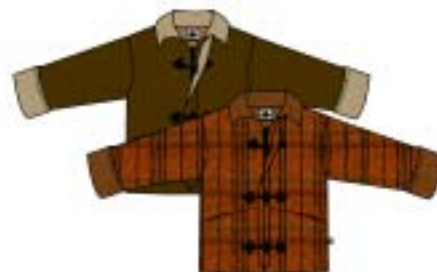
Style E8D250 Solid Toggle Coat A Great Coat! Our rugged boys coat is fully lined. Available in sizes from 12 mos to boys 10.