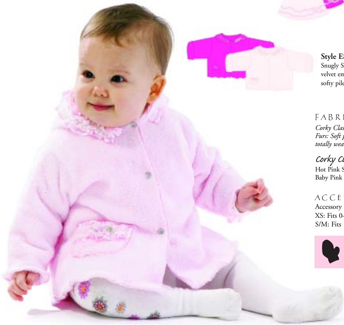
E809452 Pink Softie, Hooded Swing — Abigail (age 10M).