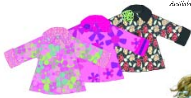
Style E8M145 Sweet Pea Coat Button front A-line coat and fully lined. Available in sizes from 12 mos to girls 10.