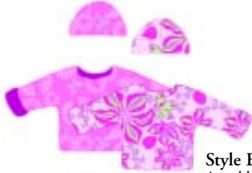
Style E8G950 Jacket / Hat Set An added touch to our original sets. Reversible jacket reverses to soft cotton Flannel with matching hat. Available in newborn to 4T.