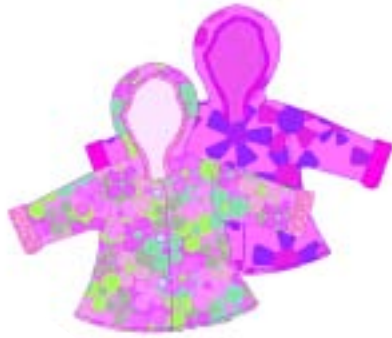
Style E8M945 Hooded Swing Coat Our new A-line swing jacket is just too cute to pass up! Available in newborn to 4T.