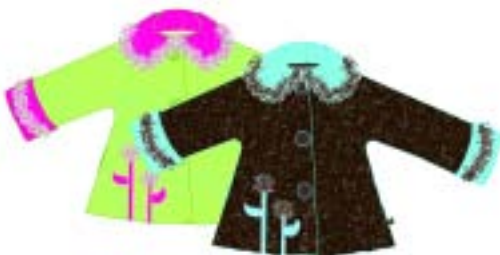
Style E8B145 Sweet Pea Coat Button front A-line coat and fully lined. Available in sizes from 12 mos to girls 10.