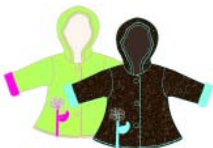
Style E8B945 Hooded Swing Coat with Fringe

Our new A-line swing jacket is just too cute to pass up! Available in newborn to 4T.