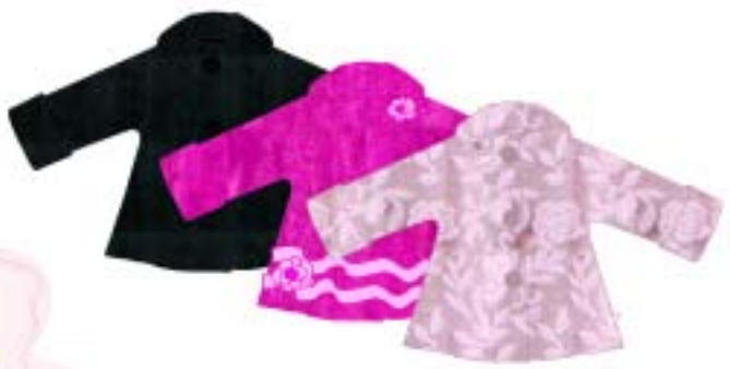
Style E80145 Sweet Pea Coat Button front A-line coat and fully lined. Available in sizes from 12 mos to girls 10.