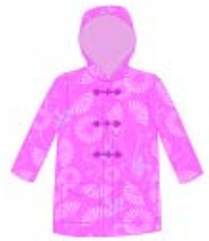
Style E8G450 Duffle Coat Styled after the British classic our Duffle Coat is fully lined with a zip closure hidden under the flap and toggle. Deep Pockets and a roomy hood make this warm and cozy coat for all ages. Available in sizes from 2T to girls 10.