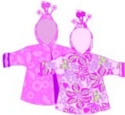
Style E8G538 Wrap Swing Coat Our Wrap Swing is fully lined. Zip up and Button Closure. Available in sizes from 12 mos to girls 10.