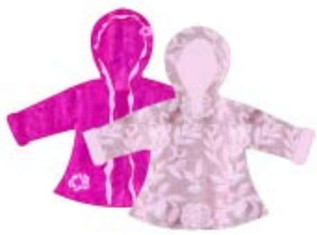
Style E80945 Hooded Swing Coat Our new A-line swing jacket is just too cute to pass up! Available in newborn to 4T.