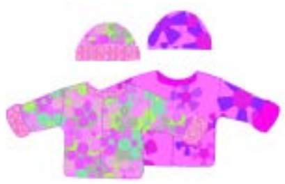
Style E8M950 Jacket / Hat Set An added touch to our original sets. Reversible jacket reverses to soft cotton Flannel with matching hat. Available in newborn to 4T.