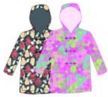
Style E8M450 Duffle Coat Styled after the British classic our Duffle Coat is fully lined with a zip closure hidden under the flap and toggle. Deep Pockets and a roomy hood make this warm and cozy coat for all ages. Available in sizes from 2T to girls 10.