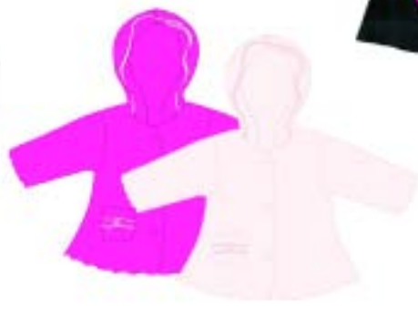
Style E809452 Hooded Swing Coat Our new A-line swing jacket is just too cute to pass up! Available in newborn to 4T.