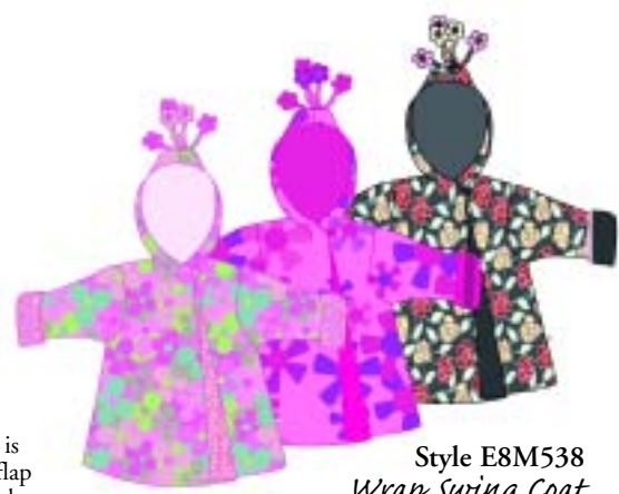
Style E8M538 Wrap Swing Coat Our Wrap Swing is fully lined. Zip up and Button Closure. Available in sizes from 12 mos to girls 10.