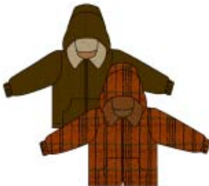
Style E8D283 Hoodie Jacket Zip-up fully lined boys jacket with large front pockets and removable hood. Available in sizes from 12 mos to boys 10.