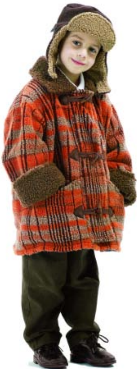
Style E8D200 Aviator Jacket A Great Jacket! Our rugged boys coat in hi-low plaid print is fully lined in fleece with popcorn sherpa trim. Available in sizes from 12 mos to boys 10.