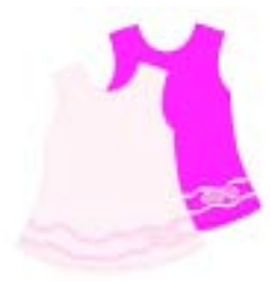
Style E80825 Pinafore Perfect little pullover jumper coordinates with everything! Paired with tee. Available in newborn to 4T.