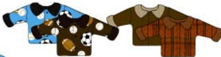
Style E8D950 Jacket / Hat Set An added touch to our original sets. Reversible jacket reverses to soft cotton Flannel with matching hat. Available in newborn to 4T.